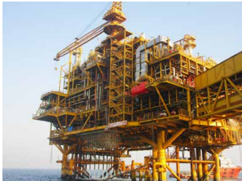
Bassein Development 3 Well Platform & Pipeline Project for ONGC

LTHE has a fully integrated capability chain, including in-house engineering and R&D centres, world-class modular fabrication facilities, as well as onshore construction and offshore installation capabilities. Major facilities in India include Engineering & Project Management Centres at Mumbai, Vadodara, and Chennai, as well as Fabrication Yards at Hazira (near Surat) and Kattupalli (near Chennai). The business has an overseas presence in the Middle East, i.e. in the UAE (Sharjah), Saudi Arabia (Al-Khobar), Kuwait and Oman (Muscat), as well as in Algeria. The business also has a major Modular Fabrication and Heavy Engineering Facility at Sohar in Oman.