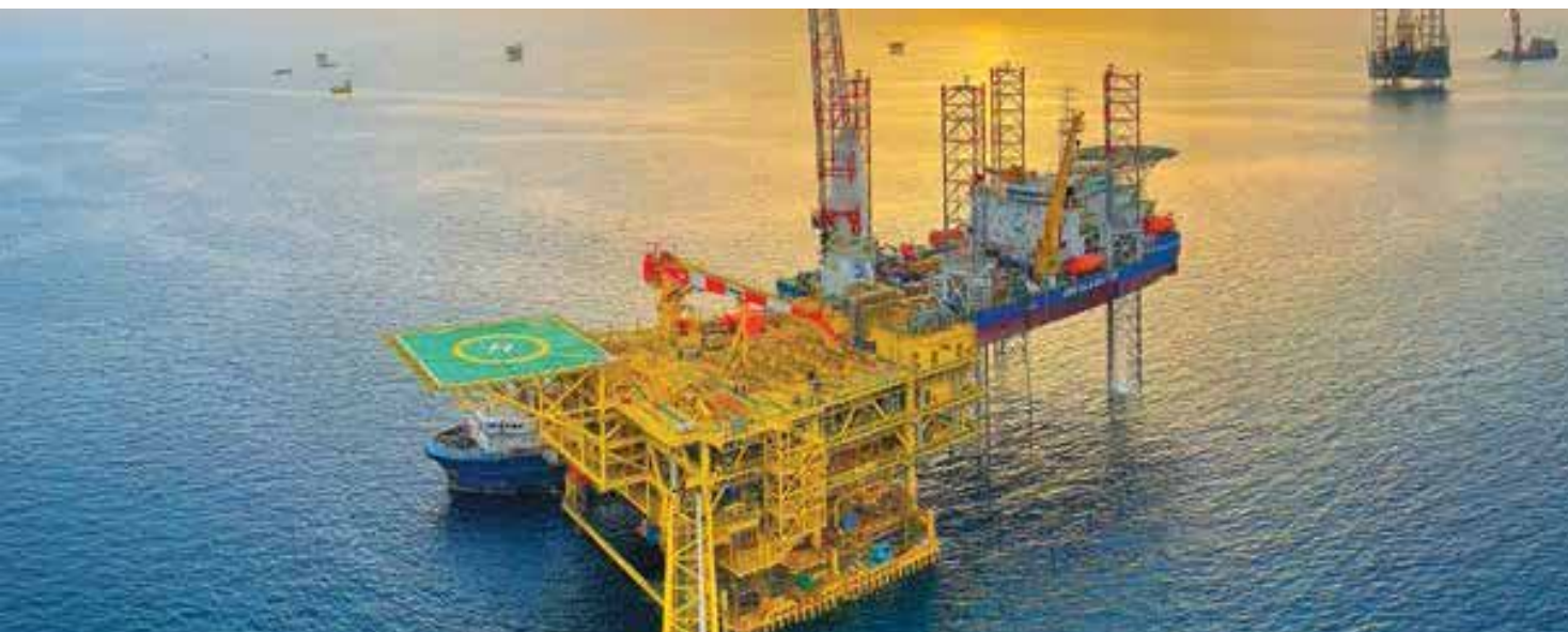
The heaviest fully integrated gas platform in Saudi Aramco's history installed by float-over method at the Hasbah field in Saudi Arabia

complemented by the Design Engineering capabilities of L&T-Chiyoda for onshore engineering and L&T Gulf for pipeline engineering.