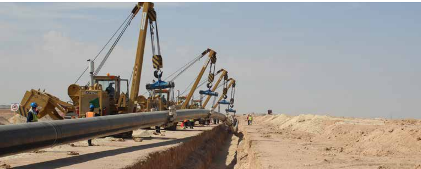
Lowering of new strategic gas export pipeline (Size: 30" / 40" x 146 km) from North Kuwait to Mina Al-Ahmadi for Kuwait Oil Company

depleted to a record low. To stabilise the plummeting oil prices, OPEC and Russia have reached an agreement to cut oil production. Further, the U.S. also cut its 2020 oil production forecast by more than 1 million barrels a day due to the plummeting demand and collapsing crude prices. Oil prices are expected to predominantly remain under stress during 2020. Volatility and uncertainty in oil prices is expected to delay project awards in the hydrocarbon segment. Further, most of the Middle Eastern GCC economies plan to diversify into several other sectors other than hydrocarbon.