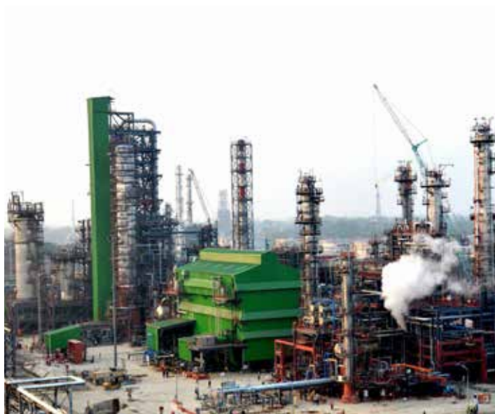
INDMAX FCC Unit including LPG Treatment Facility for IOCL, Bongaigaon, India