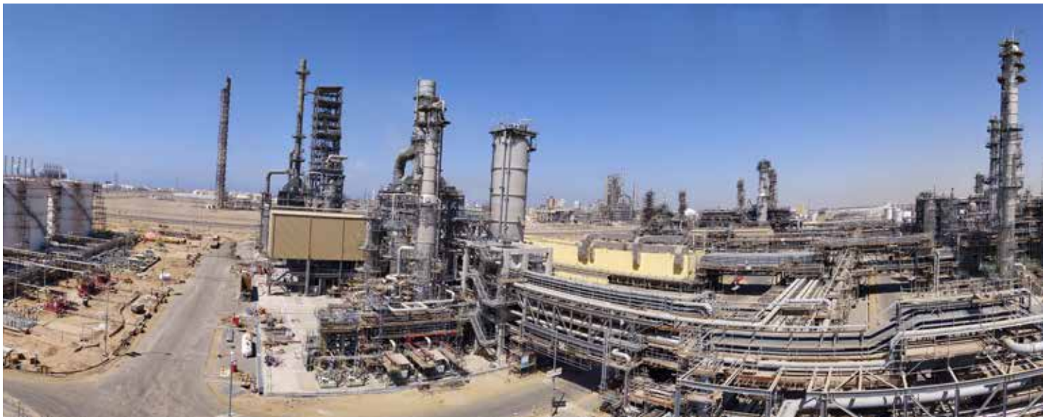
Normal Paraffin & Derivative Complex for Farabi Petrochemical Company, Yanbu, KSA

LTHE has proactively embarked on an organisation-wide Digital Transformation Programme for integrating Business Processes, Enterprise Software and robust In-house IT applications to enhance execution efficiency. This will result in shorter project cycles, project progress visualisation through Digital Walls, assured delivery schedules, cost-competitiveness and enhanced risk mitigation; thereby providing business differentiators for delivering projects. Additionally, connected-construction machinery and connected-workmen are being tracked through IoT to improve productivity.