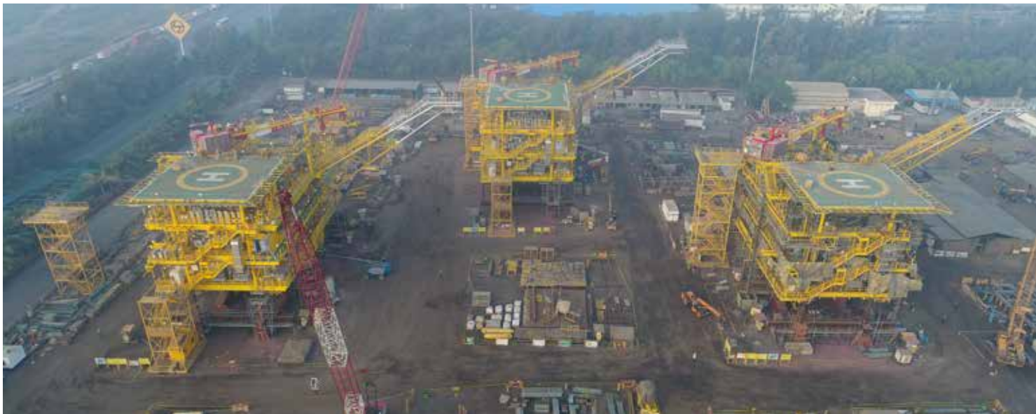
Three Gas Production Deck Modules (PDMs) for Saudi Aramco, ready for dispatch from LTHE's Modular Fabrication Facility at Hazira, India

collapse in oil demand by the shuttering of the global economy due to the coronavirus pandemic. The price of oil fell 30% due to oversupply in the first week in March, even before the impact of COVID-19 was factored in.