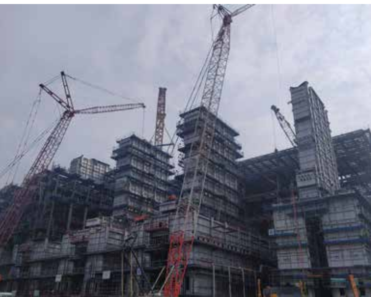
Cracker Furnace Package under execution for HMEL, Bathinda, India