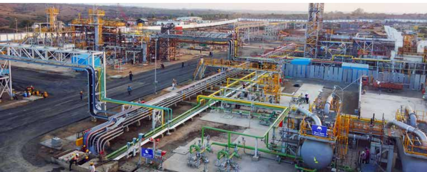
Coal Bed Methane Project (Phase II) for Reliance Industries at Shahdol, India

Electronic Permit to Work (e-PTW), Online Incident Reporting & Investigation, Behaviour-based Safety and Digital Health Monitoring.