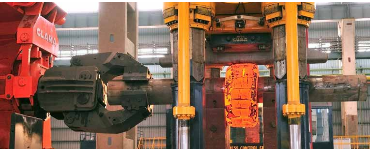
Forging of Nuclear Component at L&T Special Steels and Heavy Forgings

Terephthalic Acid (PTA) and Acrylic acid. The business is also expanding into new geographies like North Africa, Egypt, Mexico and MRU offerings for the Middle East and Asia Pacific region. To mitigate the risk of doing business in new geographies, the business avails of export credit insurance to secure credit risk.