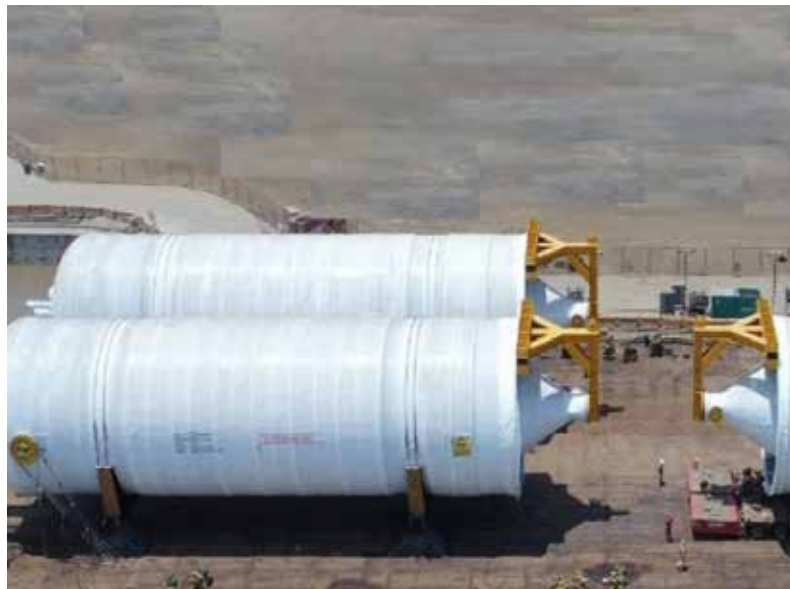
Coke Drums for Marathon Petroleum Corporation, USA