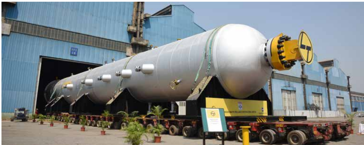
India's heaviest Hydrocracking Reactor (1858 MT) for HPCL Visakh Refinery

expand beyond quality and safety to cover project cost and other overruns.